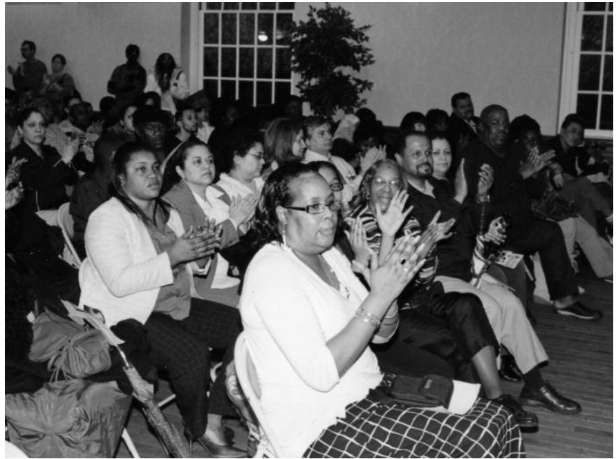
FAMILIES CELEBRATE ACADEMIC ACHIEVEMENT: Parents and family members applaud the ninth-grade students being recognized at the Consortium's Honor Roll Reception.